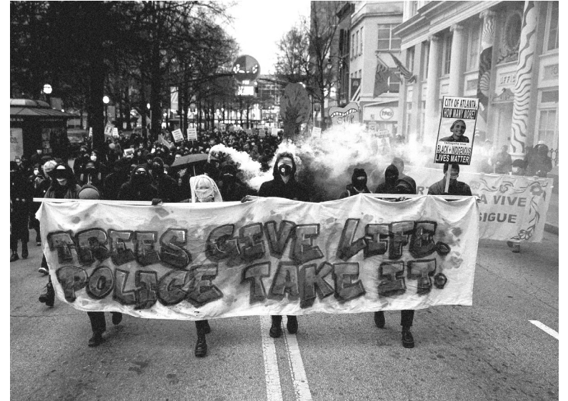
TWO YEARS OF FOREST DEFENSE IN ATLANTA

At the time of publishing, more information about the movement can be found at defendtheatlantaforest.com or on social media under the names “Defend the Atlanta Forest” and “Stop Cop City.”